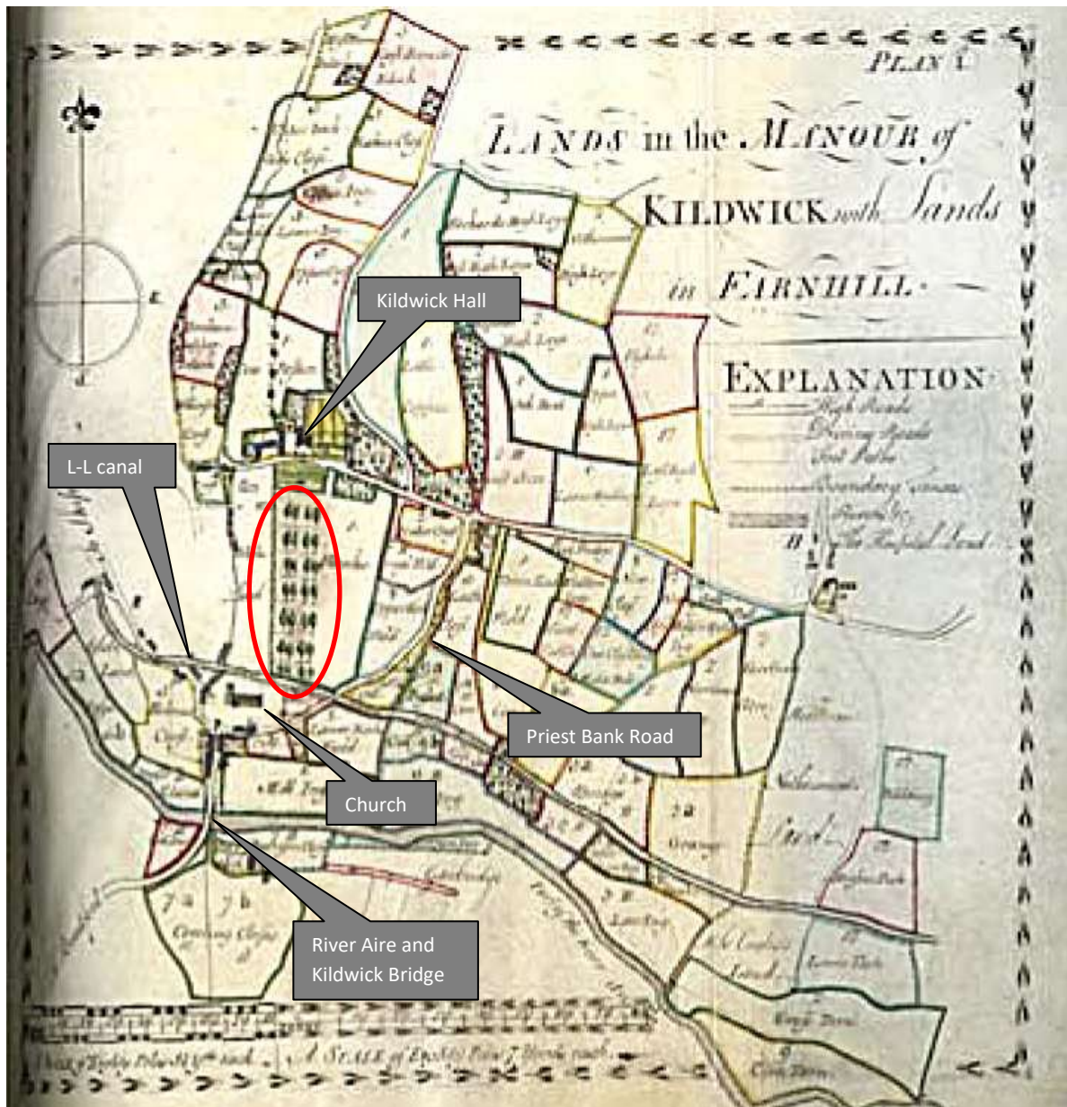
Fig 3: Map of Kildwick taken from John Currer's Survey Book of 1771

Although the quality of this image is not good, various landmarks can be clearly identified. Including the river, Kildwick Church, Priest Bank Road, the Leeds-Liverpool Canal (which must still have been under construction), and Kildwick Hall. A double avenue of trees, exactly as depicted on Haworth Currer's plan, runs down the hill from Kildwick Hall, terminating at the canal.