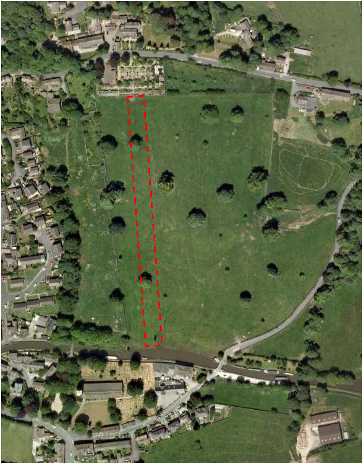
Fig 5: The line of the Kildwick Hall avenue super-imposed on a satellite view of modern-day Kildwick